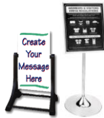
Swinger or T-Frame

Size _____ Height _____ (Max 2'width, 4' height)